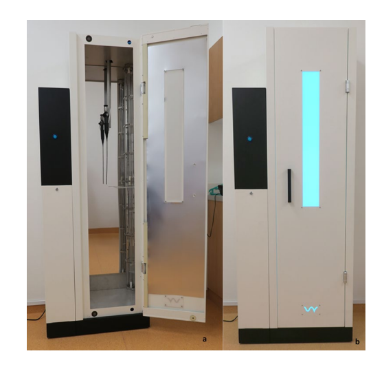
Fig. 1 a Arrangement of a FE in the D60. b Sealed D60 while reprocessing a FE \,

The UV technology used in the D60 light system (UV Smart Impelux<sup>™</sup> technology) works at a wavelength of 253.7 nm. An application dose of 1962 J/m<sup>2</sup> is delivered in each cycle. According to internal investigations of the manufacturer, the applied UV-C dose does not affect the surface of the endoscope. Nevertheless, it causes DNA and RNA destruction in irradiated microorganisms on the endoscope.