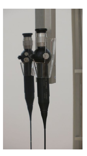
Fig. 2 Close-up of the endo-scope holder with a FE

Dirt, debris and grime are not penetrable for the germicidal effect of the UV-C light. Hence, all endoscopes must be optically clean before using the UV light system.